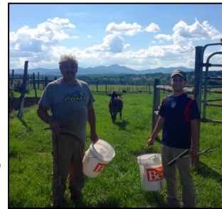
Local farmer & staff soil sampling