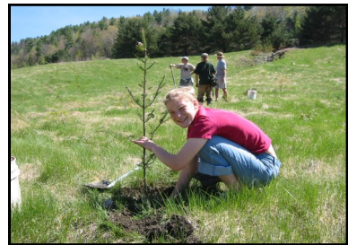
Student planting trees on the Black River

Riparian buffers are vegetated areas adjacent to rivers and streams that integral to healthy river ecosystems.